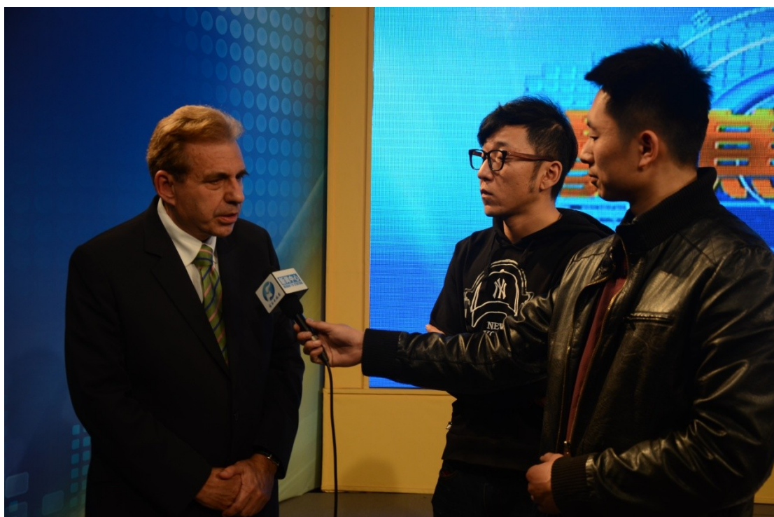
Photo 9 – Zhengzhou TV interviewing John Kasarda on development of the Zhengzhou Airport Economic Zone